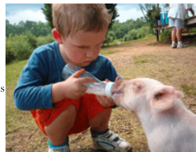
Casey the Pig loves meeting, greeting and eating with the guests of Happy Berry Farm in Six Mile. www.thehappyberry.com