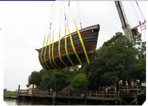
The Adventure was successfully pulled from the water and placed in a cradle for repairs.

team from SCPRT and the park service have done a remarkable job in safely relocating the 'Adventure'. Thanks to their efforts, over the next year the public will have a unique opportunity to observe first hand the shipbuilding techniques of the Age of Sail."